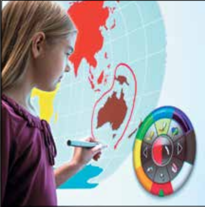
Marker board capabilities

The latest Dry Erase Screen features upgraded durability, surface uniformity and rigidity to ensure a superior interactive experience. The erasable surface is hotspot-free under projection, and now comes with new standard features - all Dry Erase Screens are magnetic and have a thin frame. It can be used with an ultra short throw projector as an interactive screen or as a whiteboard with dry erase markers.