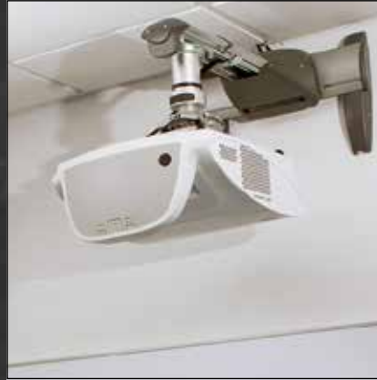
Designed for interactive and ultra short throw projectors