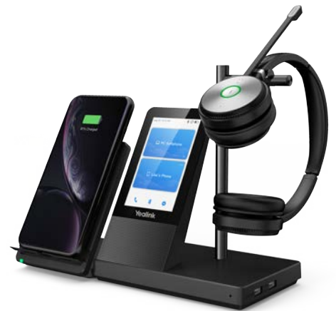
WH66 with charger * Wireless charger is optional

Busylight is enabled in WH66. With the light on the headset or BLT60 on the desk turning red, people around you would know that you are on the phone, instead of interrupting you unknowingly. Just stay focused on conversation, for higher efficiency, for better collaboration.