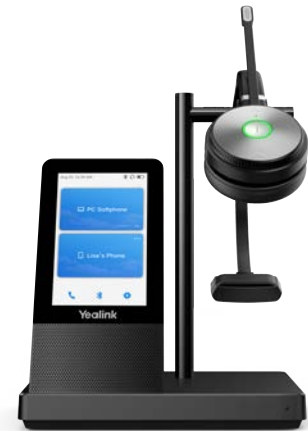
WH66 Mono/Dual: Teams WH66 Mono/Dual: UC