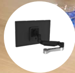
R-Go Extra arm