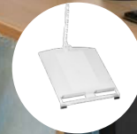
R-Go Morelia Document holder