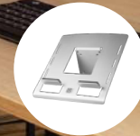
R-Go Morelia Notebook holder