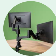
R-Go Caparo/Zepher Twin