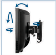
Adjustable screen angle - 360° Rotation; 60° Swivel; ±15° Tilt

Monitor mount x 1 / Wall mount x 1 / M4 (12mm) x 4 / M4 (30mm) x 4 / M5 (12mm) x 4 / M5 (30mm) x 4 / Allen wrench (3mm) x 1 / Allen wrench (4mm) x 1 / Wood screw (Ø6 x 50mm) x 2 / Plastic peg x 2 / Spacer x 4 / User Guide x 1