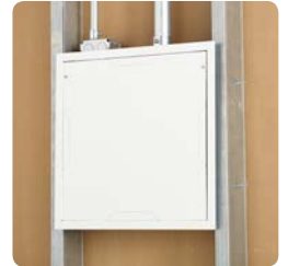
Paintable Flanges and Covers