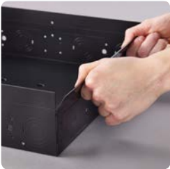
Break Away Edges

Chief engineers talked to customers like you about in-wall boxes and your biggest headaches on the construction site. Then they designed all new in-wall boxes to solve those headaches with multiple depth and ordering options.